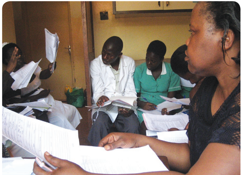
Health workers review and score partographs using the partograph review tool during on-site coaching and mentoring training at Hoima Hospital.

As part of the baseline situation analysis conducted at the 12 sites where EmOC training had taken place, a partograph assessment tool developed by Fistula Care was utilized to assess the correctness and completeness of partograph plotting. This tool was also used to collect data immediately prior to training and during follow-up visits one month, three months, and six months