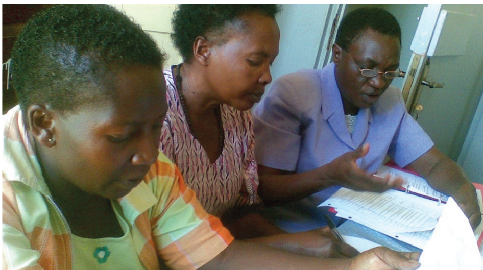
A national trainer reviews completed partographs with facility staff during follow-up visit at Kalungu Health Centre III.

Fistula Care is currently working with the district health management information system and designated staff at facilities to improve data storage and use of data for decision making. Use of the partograph needs to be clearly linked to clinical protocols for treatment and referral. Plotting data will not achieve meaningful changes in outcomes without appropriate decision making and actions taken to address the findings.