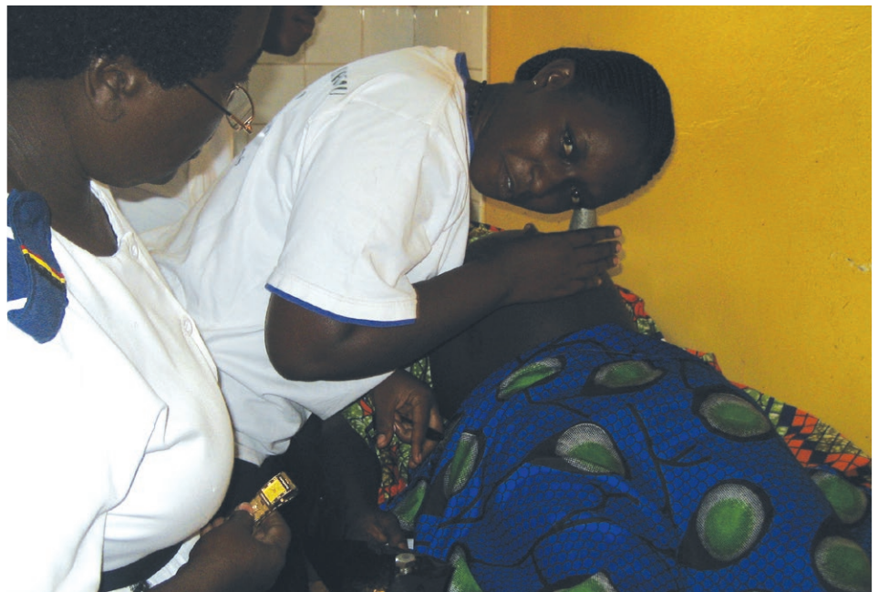
A partograph champion demonstrates listening to the fetal heart to colleagues at Hoima Hospital.

Chronic human resource shortages and high staff turnover were the greatest challenges to effective implementation of this intervention; they are among the greatest barriers