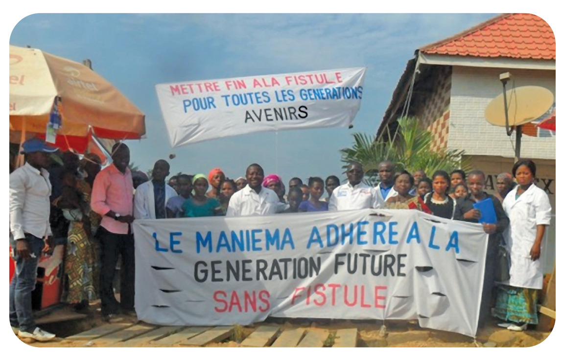
Celebration of the International Day to End Obstetric Fistula in Kindu.

Partner facilities designed annual commemorative events with local partners to celebrate the International Day to End Obstetric Fistula, held each year on May 23rd. Celebratory events included radio and television shows, parades, roundtable discussions, and surgical outreach efforts. These events, which sought to reduce community-level stigma around fistula, raised awareness of fistula prevention and the availability of fistula care.