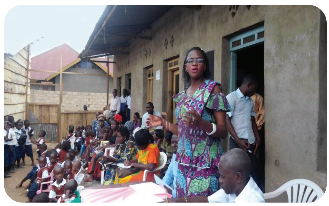
Imagerie des Grands Lacs community outreach event in Beni.