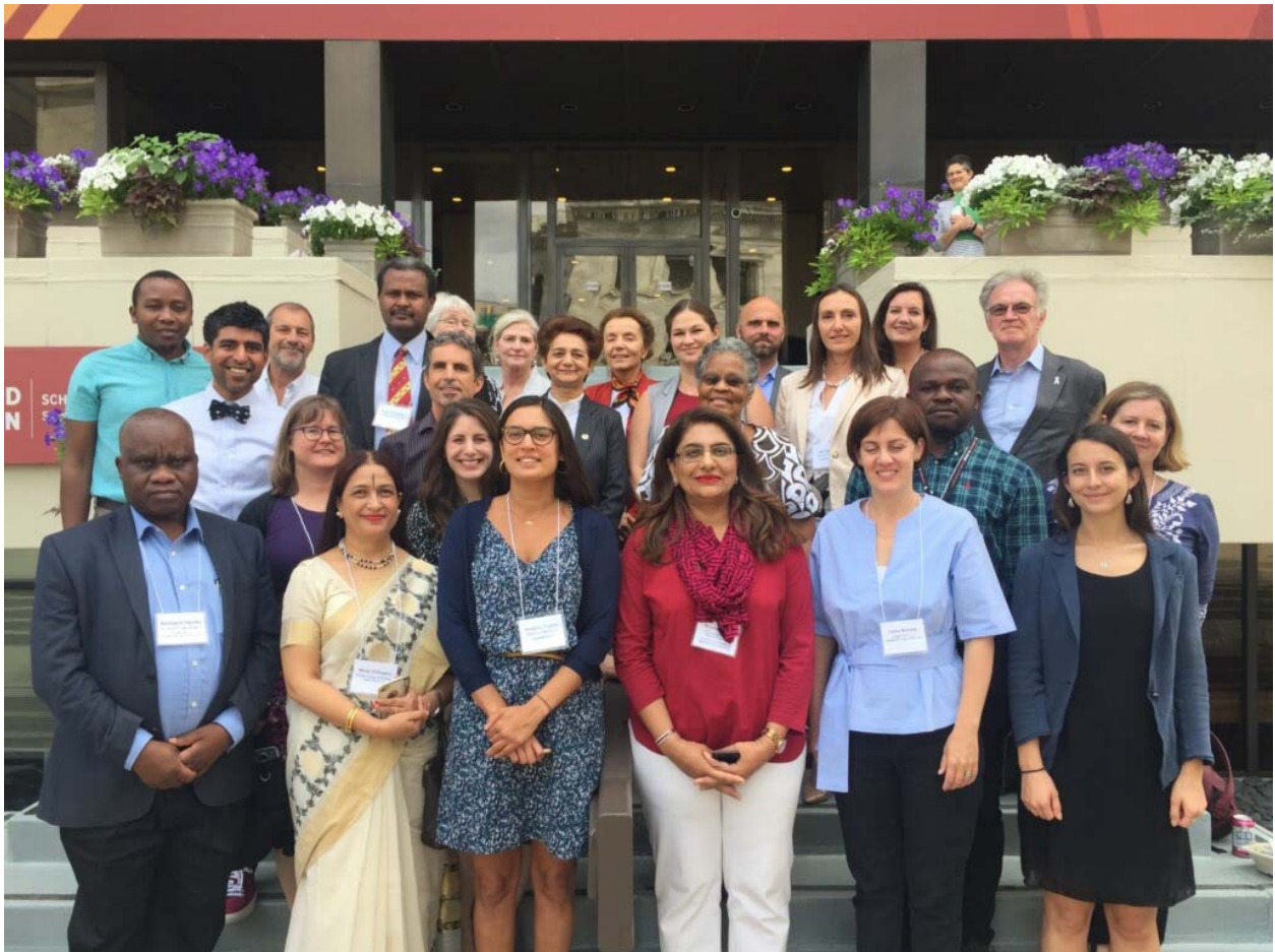
Consultation participants, July 28, 2017