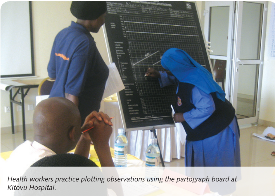
Health workers practice plotting observations using the partograph board at Kitovu Hospital.

well and were not applying the skills and knowledge acquired during training. A new training approach was needed.