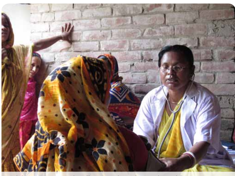
Ad-din/Jessore's paramedics offer antenatal consultations close to home.

SDU staff and village health volunteers hold regular health education sessions at the SDU and