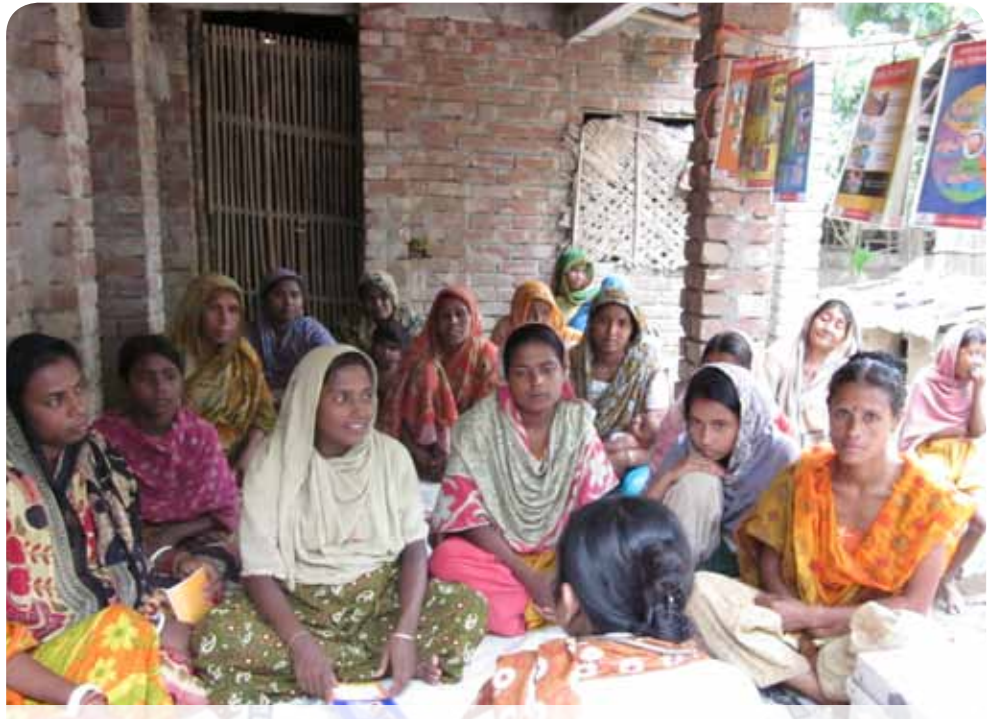
Satellite clinics offer health education before individual consultations begin.

committees. While most SDUs are not yet financially independent, LAMB has a clear plan for and commitment to transferring all responsibility to the clinic management communities once their capacity has been built and demonstrated